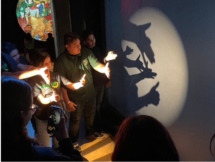
Pictured above are 8th grade students enjoying the black and white exhibits in LA's Academy Museum of Motion Pictures.