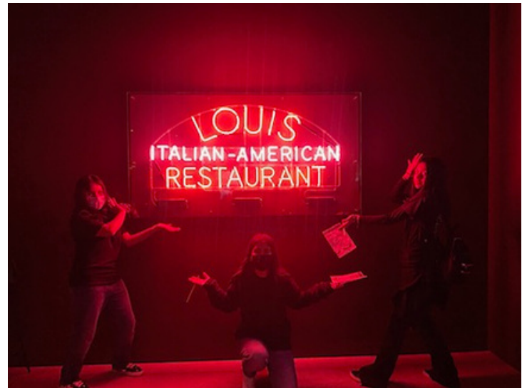
One of the exhibits at the Academy Museum of Motion Pictures allows the public to explore "The Art of Movie Making." This exhibit paid specific attention to the award winning film, The Godfather . Pictured above are 8th grade students in this exhibit, showcasing one of the signs used in the movie.